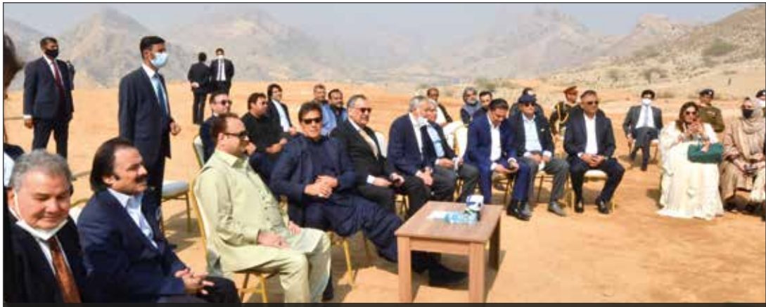
Chairman, Mr. Imran Khan along with the Namal Family

Mr. Imran Khan and the Namal Family gathered at the site of Namal Knowledge City to review and deliberate on the plan for development of Phase 1.