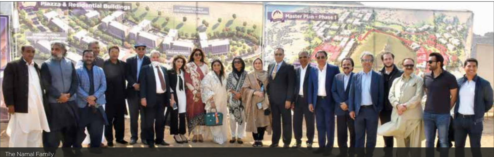
The Namal Family