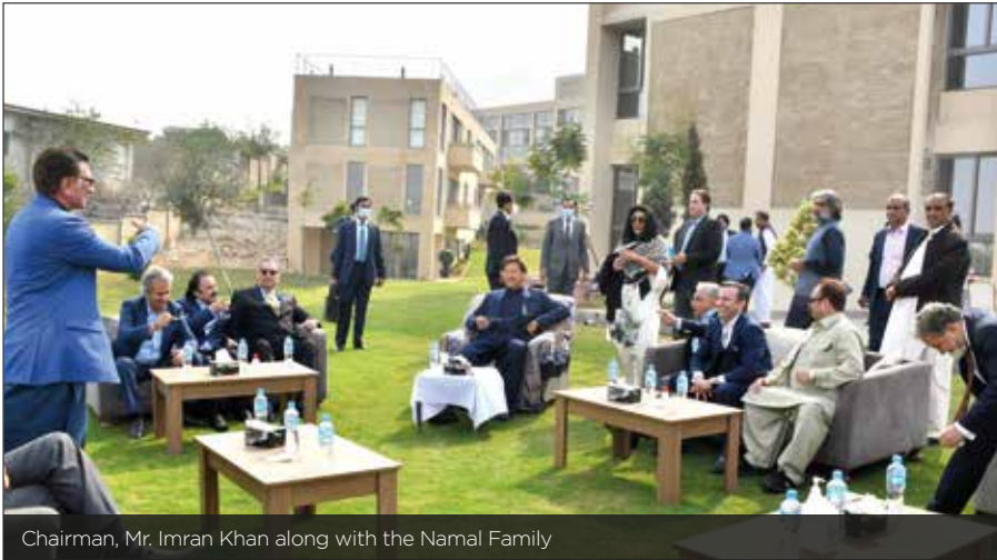
Chairman, Mr. Imran Khan along with the Namal Family