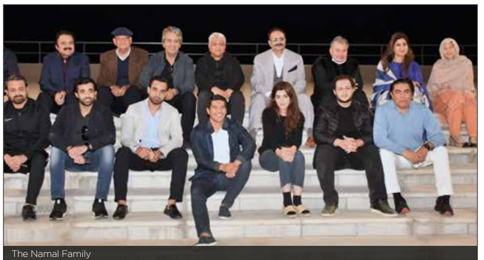
The Namal Family