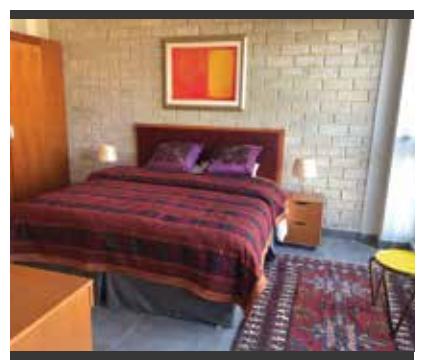
Model bedroom, inside residency