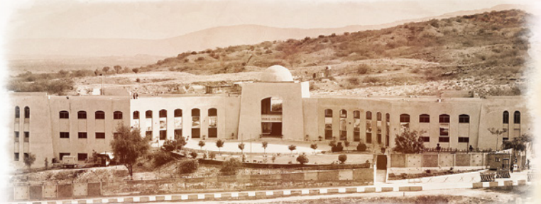
2008: Namal University's main building