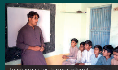
Teaching in his former school