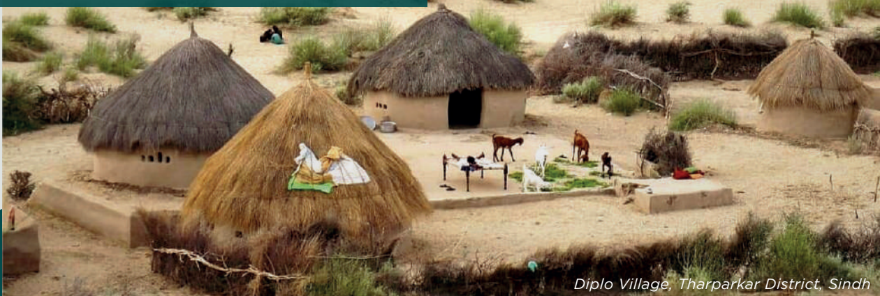
Diplo Village, Tharparkar District, Sindh