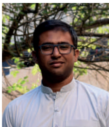
Class of 2015