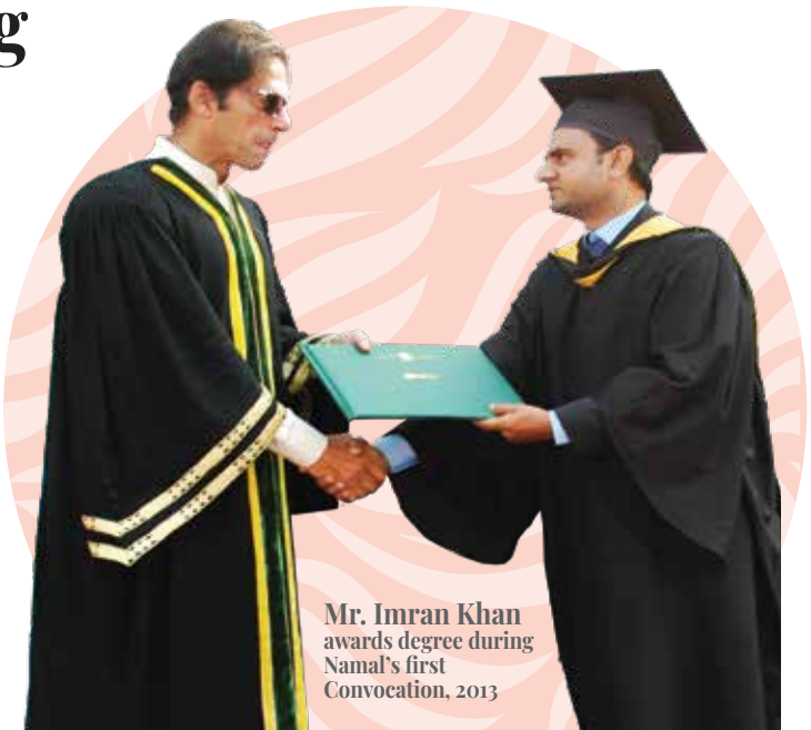
Mr. Imran Khan awards degree during Namal's first Convocation, 2013

350,000 sq ft of academic facilities/ buildings constructed 150,000 sq ft of non-academic facilities/ buildings constructed